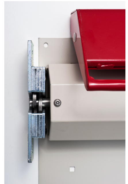
[ CLAW LATCH ]