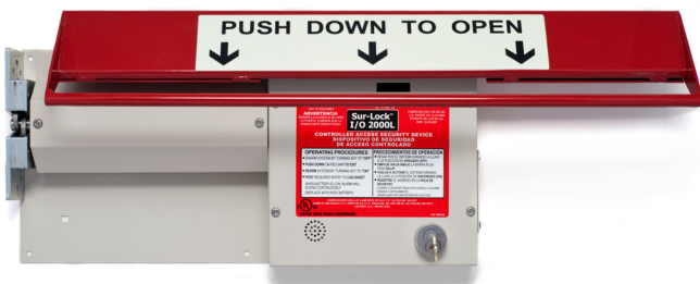
[ SUR-LOCK ]